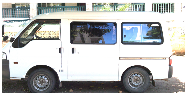
The school van with new rear windows.

Lastly, at the end of term, all the children received a food parcel to take home for the "Summer Christmas" holidays. Because this break is quite long we worry that some of the children aren't adequately fed when at home.